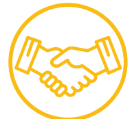
Job Search Assistance